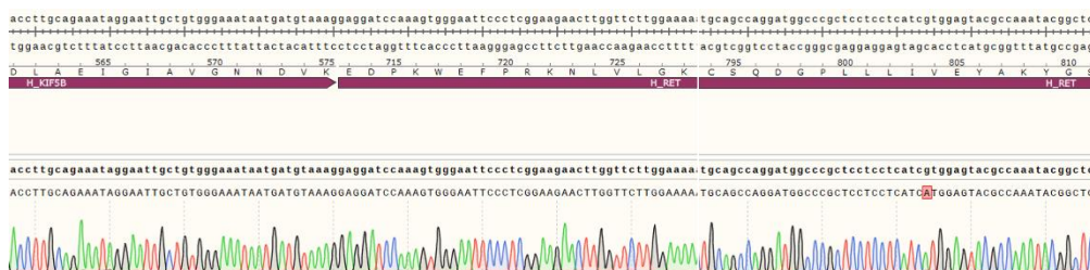
Figure 2 | The KIF5B-RET mutation analysis by Sanger sequencing.